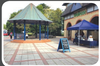
Site 9 - Size 4m X 4m Bandstand With Power