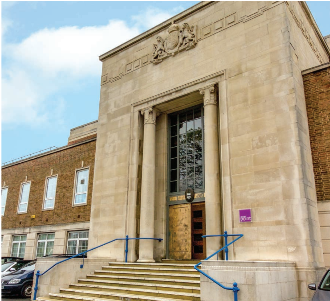
Access Point Offices, The Old Court House view from the front www.apcvenues.net