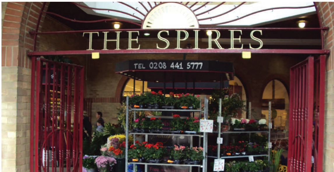
Interior and exterior views of the The Spires, Barnet