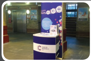
Site 7 - Size 1m X 1m Pop Up Stands Only No Power